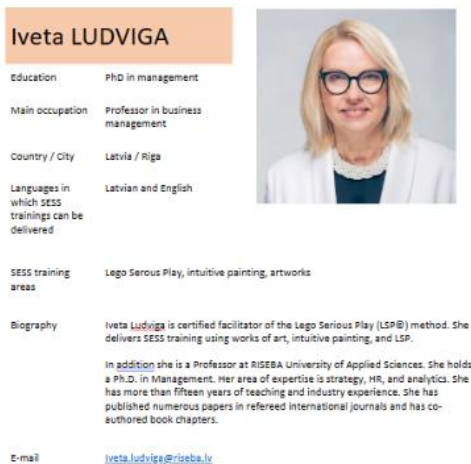
Catalog of SESS trainers