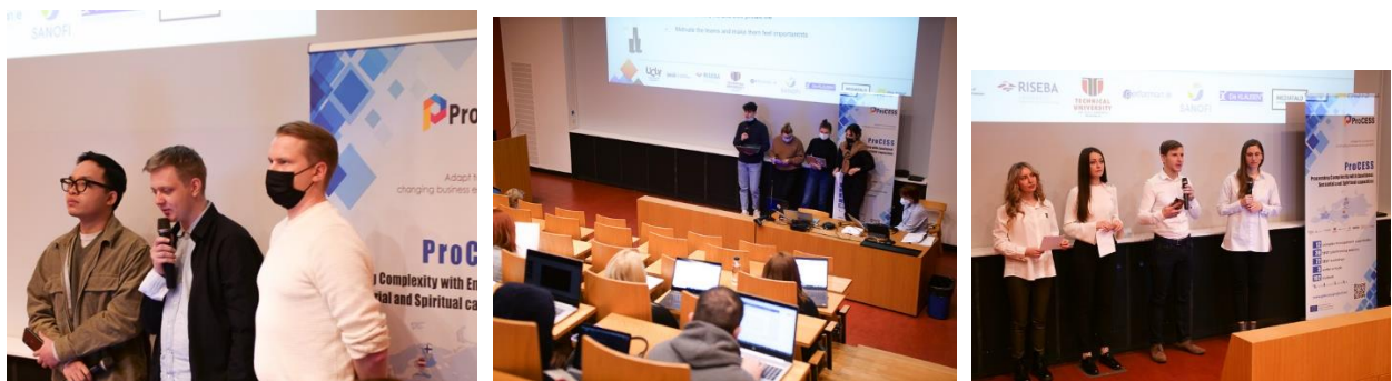
Final Presentations at 1 st ProCESS Winter School organized by JAMK

Sciences. The event took place during 24-27 January 2022. At the event, all 16 students from the four teams that participated in the Keski-suomalainen case study, the Academic Coaches, and the Company Coaches participated. After the presentations the Company and Academic Coaches analyzed the results and gave feedback for the students' activity and receive a certificate for their implication in the ProCESS Project. Beside the final presentations, during the 1 st ProCESS Winter School, other activities were also organized: interviews of students, Academic and Company Coaches conducted by partners from PerformanSE, "Complexity Sonaatti" webinar coordinated by JAMK SESS trainers, focus group with academic coaches, presentation of Mediatalo Keski-suomalainen and free-time activities.