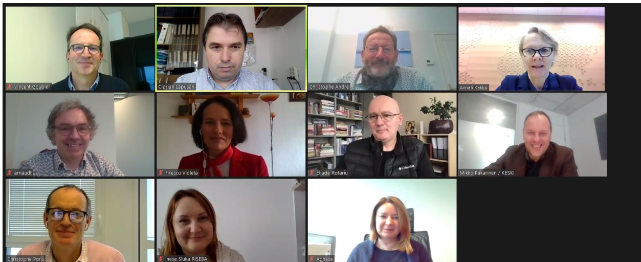
Process Steering Committee

The European Commission's support for the production of this publication does not constitute an endorsement of the contents, which reflect the views only of the authors, and the Commission cannot be held responsible for any use which may be made of the information contained therein.